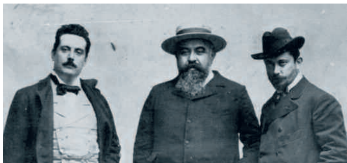
Puccini, Giacosa and Illica