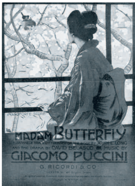
Cover of the vocal score of Madama Butterfly