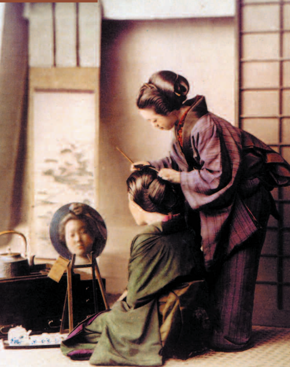
Hairdressing session.