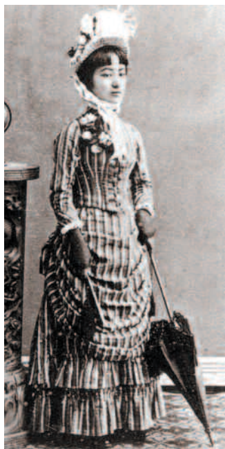
Woman in Western dress, photographed by Hikoma Ueno, Nagasaki, early 1880s.

could still be exchanged for periods of service so long as the arrangement did not go against the will of the woman in question. Needless to say, much coercion, physical and emotional, was exerted on hapless women, often merely girls, by impoverished or greedy families or guardians. The new term for the profession was ' geisha '. Ostensibly, the geisha was merely required to provide entertainment in the form of song and dance. Privately, she was as much in debt as her predecessors had been to the people who raised and trained them, and she still often needed to find a lover to pay off her debts for her.