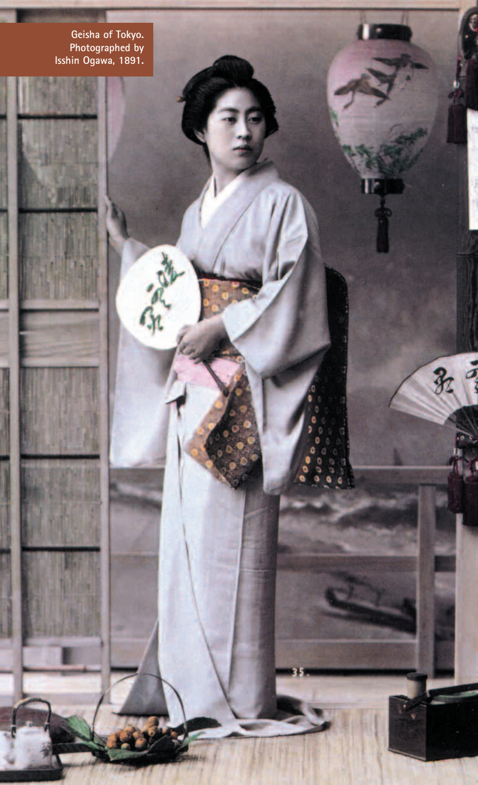
Geisha of Tokyo. 1891.