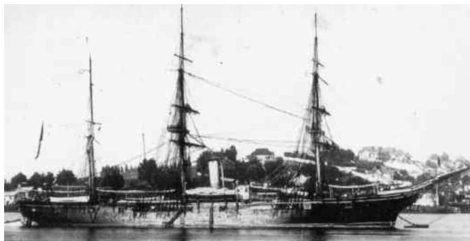
USS Marion